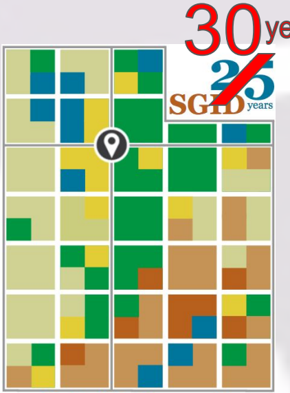
Utah's State Geographic Information Database - established 1991 -